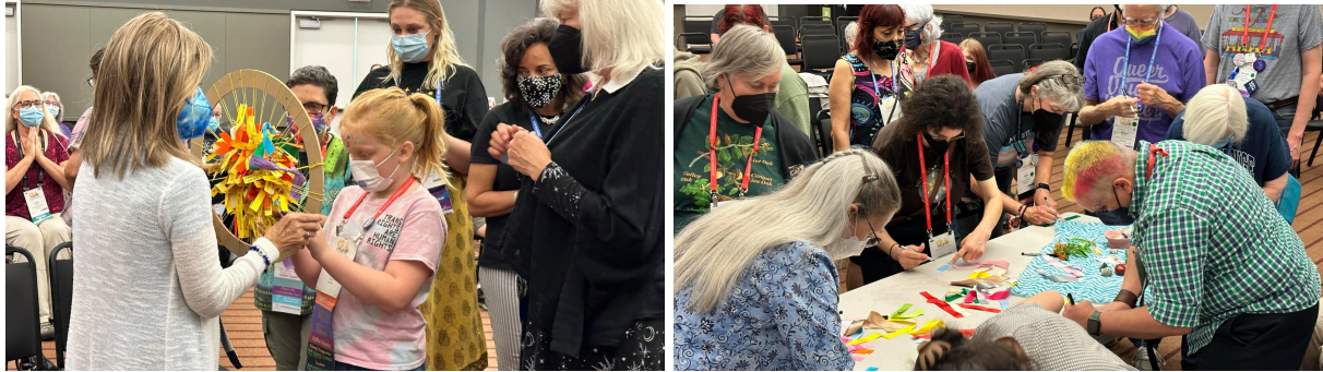
In Person Summer Solstice Ritual at UUA 2023 General Assembly