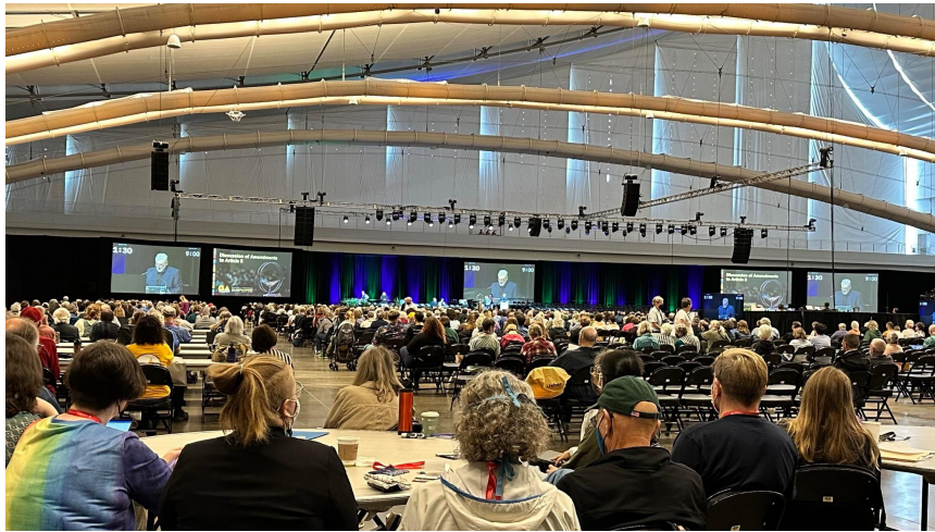
Plenary Session at 2023 UUA General Assembly Pittsburgh